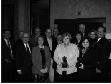
Elected officials, Youth In Need staff and Board and AT&T staff celebrated AT&T's grant to Youth In Need.