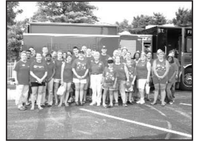
Target staff and volunteers gave the community a safe night out.