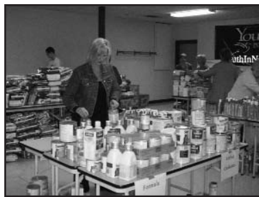
Staff and volunteers sorted thousands of baby items donated for teen parents.